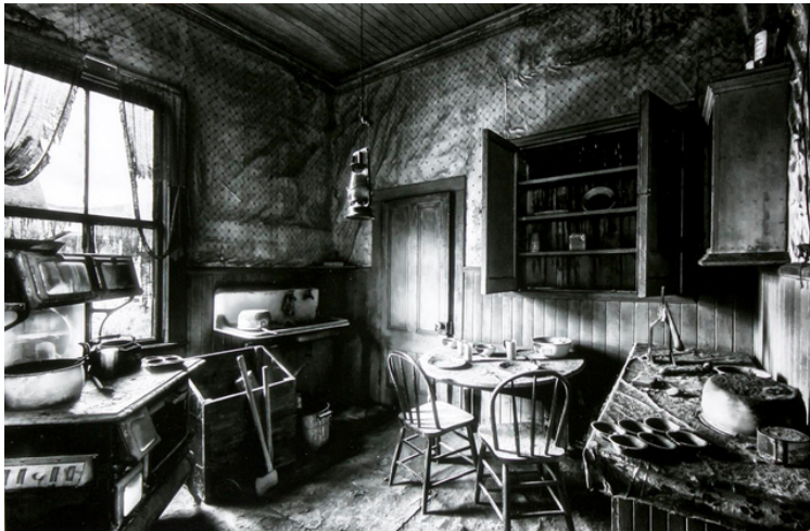
The Kitchen 2014 Print of the Year - Honorable Mention Monochrome 96 Square