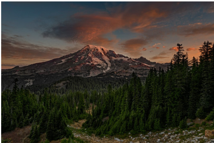
Looking Up at Paradise 2016 Top 80