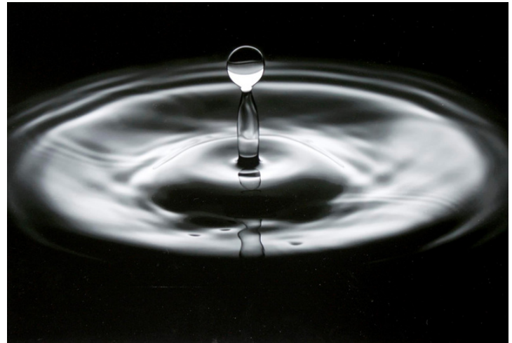
For Every Action 2014 Print of the Year - Winner Monochrome 96 Square